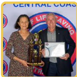
DEFIB PROJECT MACMASTERS SLSC