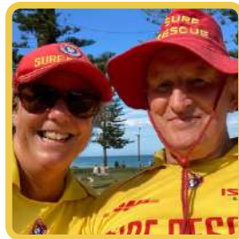
TAKE IT TO THE BEACH OCEAN BEACH SLSC