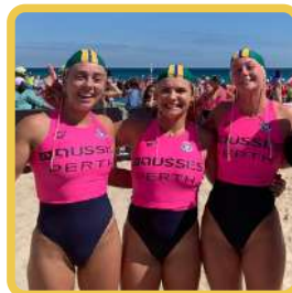
U19 FEMALE TAPLIN AVOCA BEACH SLSC